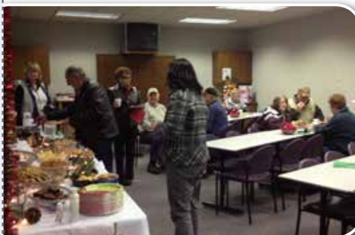
Guests enjoy sweet & salty treats at the open house.

Thank you to all who attended – we look forward to seeing you at other BEK events held throughout the year!