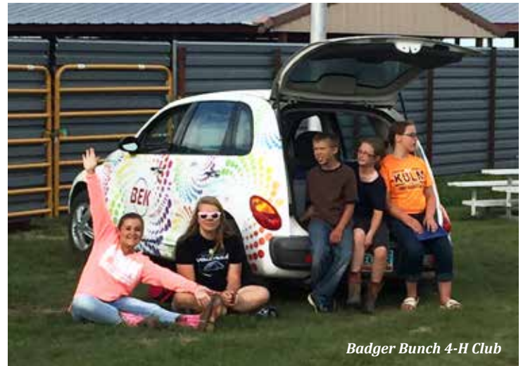
Badger Bunch 4-H Club

this fund raising project and reported that sales were good, and the ice cream was a hit!