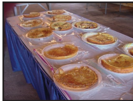
How sweet it is!